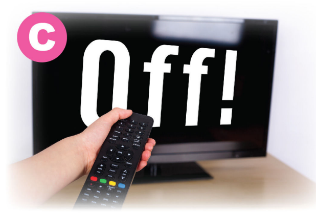
Turn off the TV when it is not in use