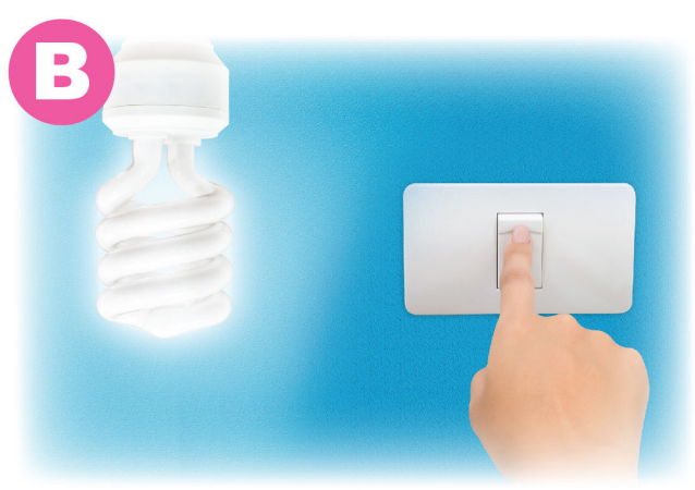
Switch off lights that are not in use