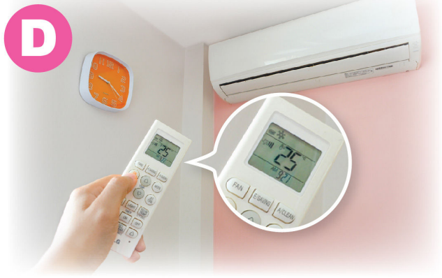
Set the air conditioner temperature to around 25.5 °C