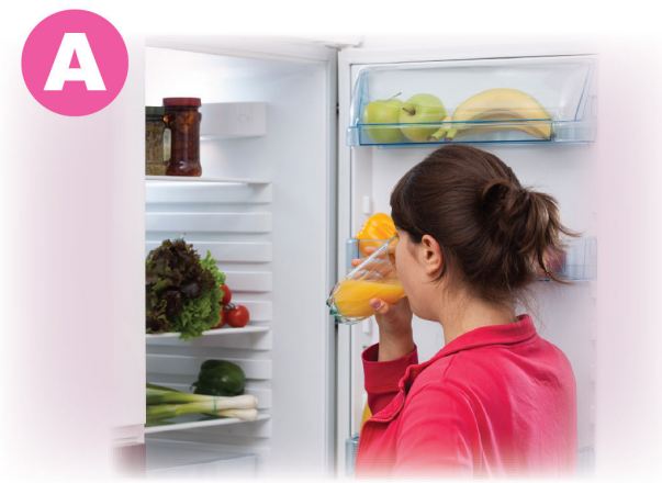
Keep the fridge door open for a long time

Which of the following pictures show ways to save electricity? Write the correct letters in the blanks below.